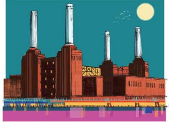
Ballinson Prince Station