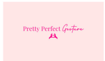
Sep 01, 2025 Helping SEN Students Feel at Home