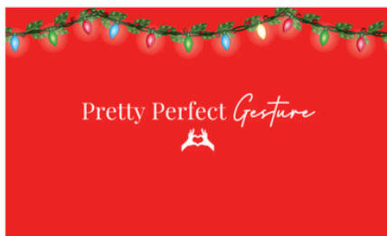
Nov 28, 2025 12 Days of Giftmas: Our Plan to Give Back

Pretty Perfect Gestures: Our commitment goes beyond our products. Giving back is an essential part of who we are, and each month we carry out a Pretty Perfect Gesture — from small, thoughtful acts to larger community initiatives. These gestures allow us to support others, share kindness and make a positive impact, reflecting the values at the heart of Pretty Perfect Products.