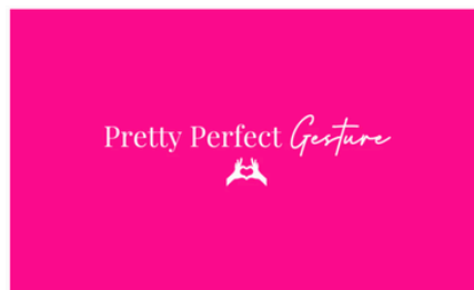
Oct 01, 2025 PPP x One Love Project: September's Gesture