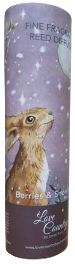
BERRIES & SNOWFLAKES: FRD007