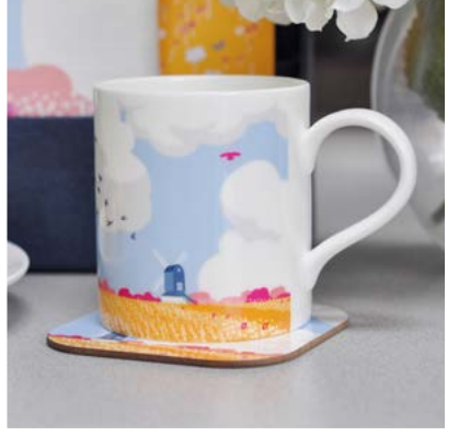
NEW DESIGN - Big Skies & Windmills