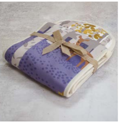
Folded into a neat parcel, tied with a ribbon with a swing tag

NEW DESIGN Rolling Hills Apron RRP £25.00