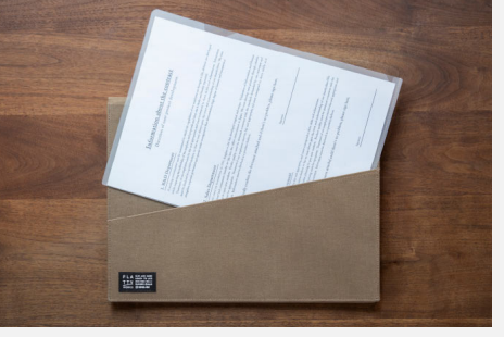
With a back pocket for storing frequently used items.