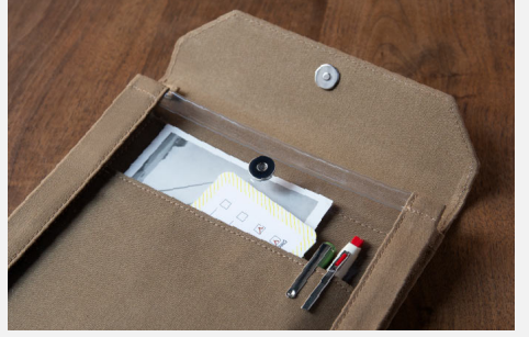
To organize small articles, use its inner pocket.