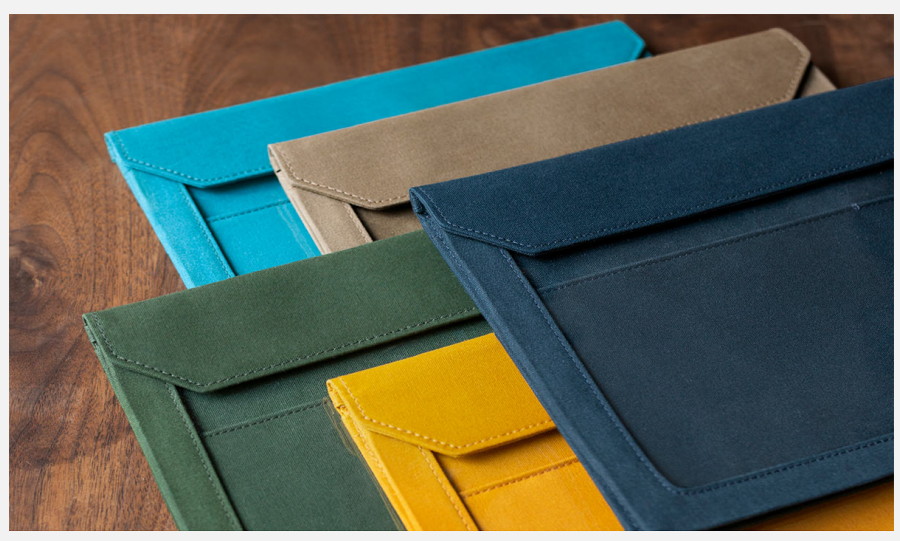
Long-term use gives an additional charm to its paraffin-waxed canvas.