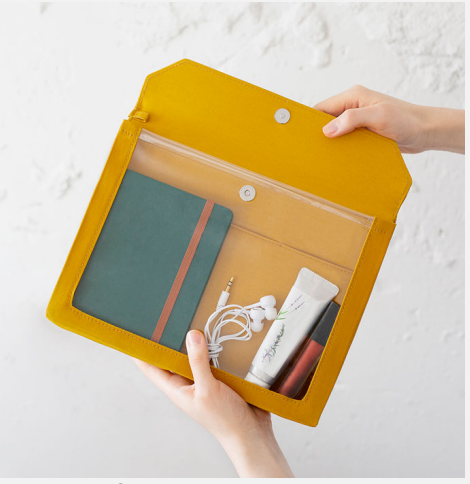
<u>POINT</u>3 Easy to open and close with a magnet.

<u>POINT</u>2 Durable material to protect the things inside.