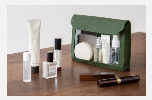
It is thicker than standard ones and has a larger capacity.