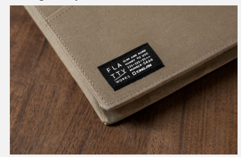
The logo is on the back.